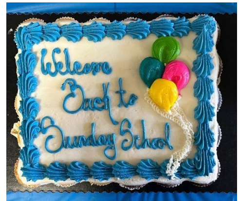
Sept 8, cake and water ballons